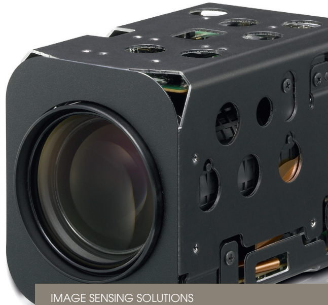
IMAGE SENSING SOLUTIONS

Sony, a leader in high-definition (HD) technology and the imaging industry, is combining its strengths with the introduction of its new compact FCB-EH6300 20x HD Colour Block Camera.