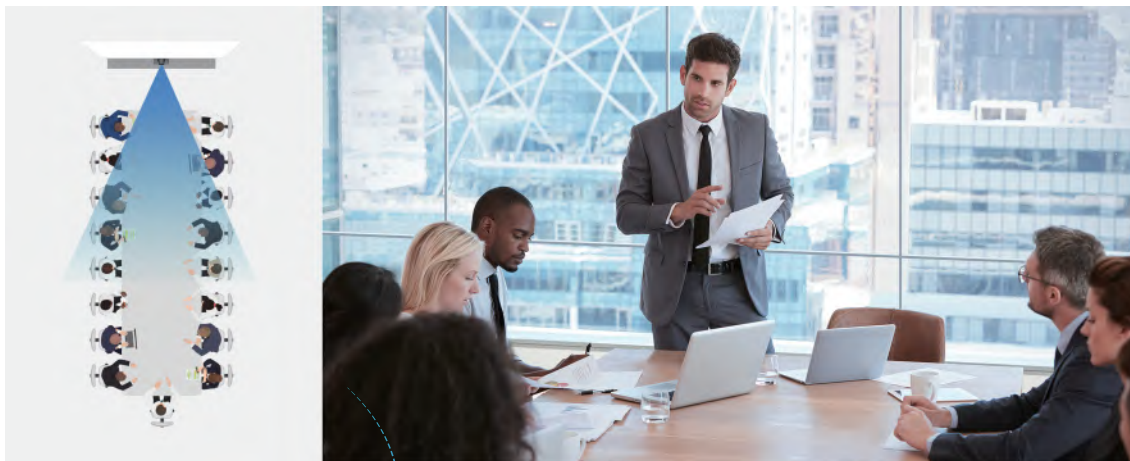
12x optical zoom